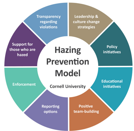
Cornell's comprehensive public health approach to hazing

professional) is foundational for academic and life success. In 2019, Cornell University adopted a set of core values that serve as the foundation for a more equitable and inclusive atmosphere for all Cornell campuses, including a community of belonging where students, faculty, and staff can learn, innovate, and work in an environment of respect.