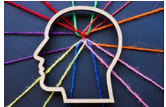
Cornell Health can help connect you with ADHD evaluation and medication management services.

If you are currently taking ADHD medication , please note that it may take two to three months from the time you initiate care to complete the transfer of your medication management to Cornell Health. Be sure to plan ahead with your