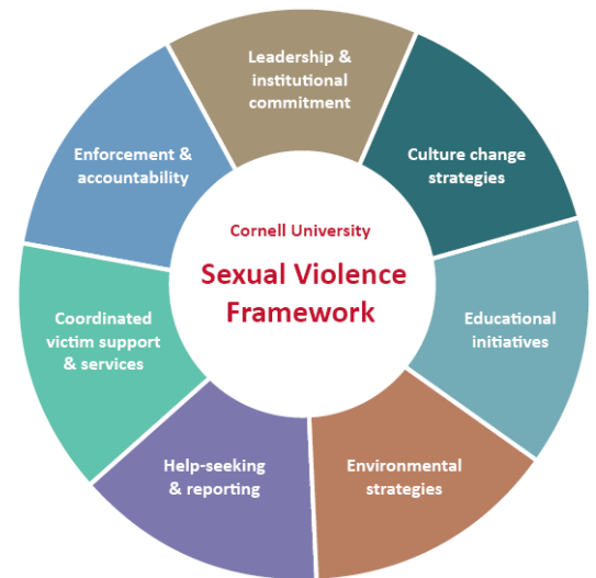
Cornell's comprehensive public health approach to sexual violence prevention

Program Director: Sexual Violence Prevention and Victim Advocacy Cornell Health 110 Ho Plaza Ithaca, NY 14853-3101 email: nc18@cornell.edu