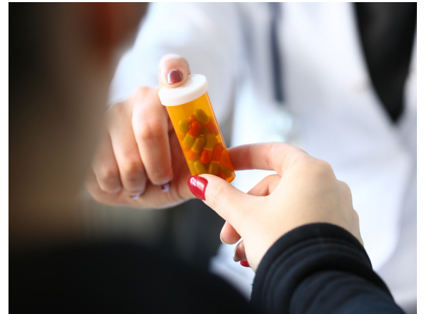
EPT enables sexual partners to be treated for certain STIs without requiring a medical visit.

All three STIs can cause symptoms, but many people experience no symptoms. Individuals without symptoms should still be treated with