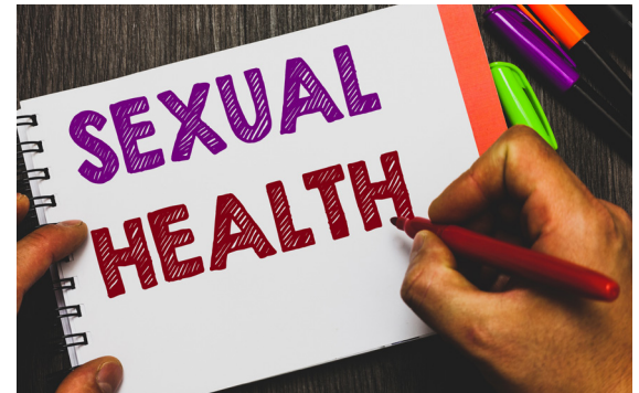
Prioritize your sexual health by reducing risks of STIs.